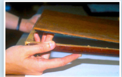
◀ Determine if anything is attached to glazing by sliding a microspatula between the mat layer or work on paper, and the glass. If safe and possible, slowly lift the glazing from one corner, coaxing the mat or paper onto a support.

Removal of wet papers from frames is made difficult by compromised papers and media, media and paper stuck to glazing, expanded mat boards, loosened frame joints and rusted hardware. Inspect the framed work to determine potential problems and the best approach to remove it from the frame. ▶